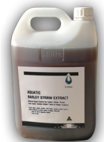
5lt Barley Straw Extract

Aquatic Technologies, leaders in algae diagnosis & solutions recommend The Aquatic AT2500/AT5000 All-in-one Fountain Filter-Pump can be used in conjunction with our Barley Straw Extract to control algae.