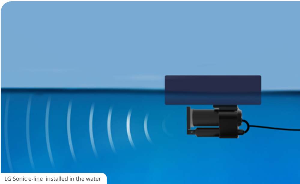
LG Sonic e-line installed in the water

Specific ultrasonic sound waves based on Chameleon Technology™ can be used to control algae in ponds.