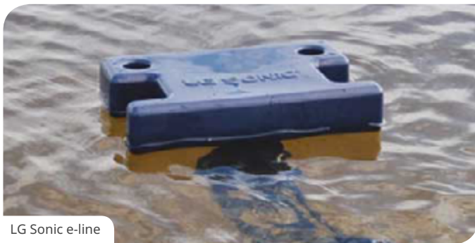
LG Sonic e-line